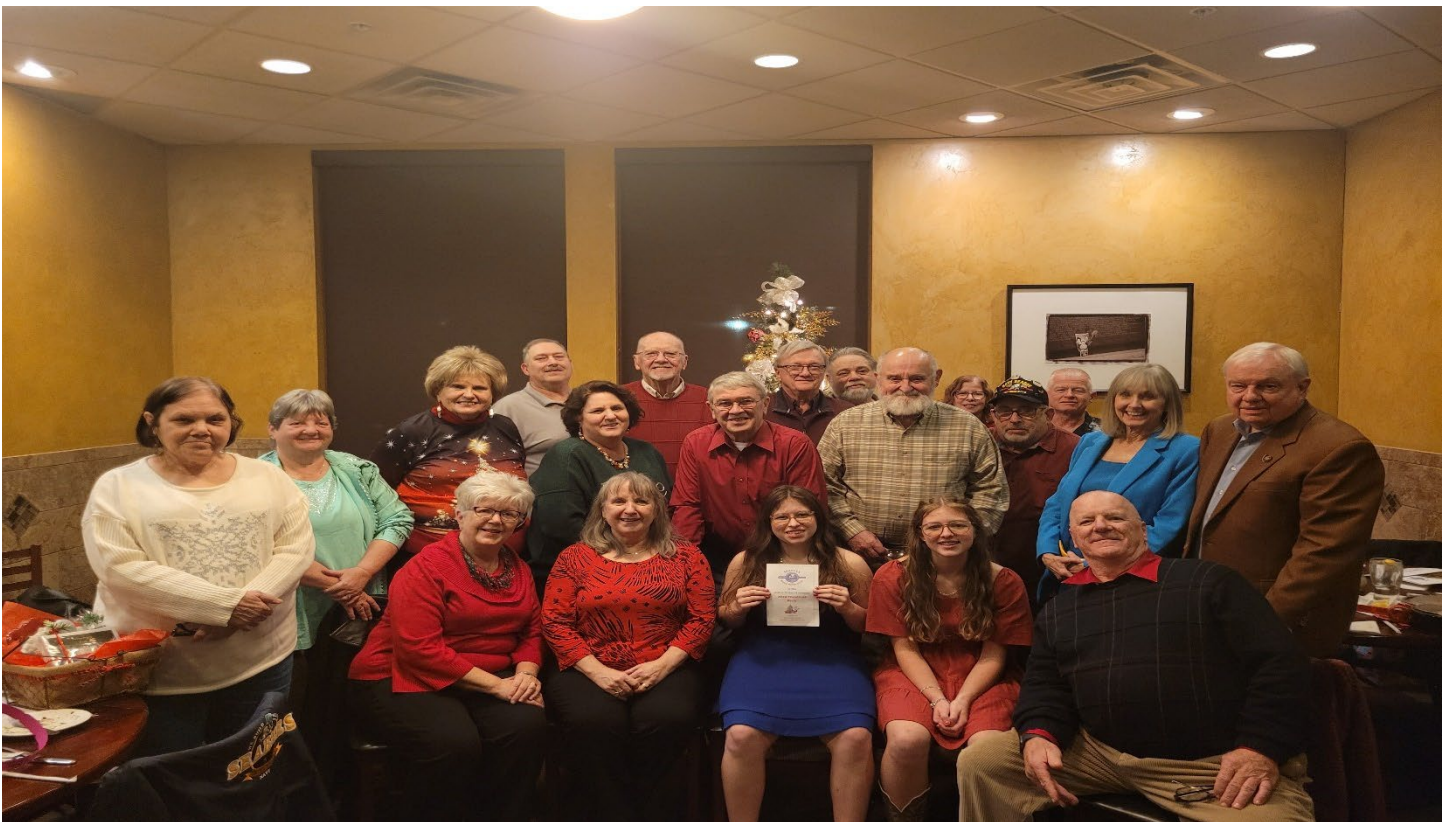
Island X-3 Pittsburg PA's annual Christmas Party and the island's 30th Anniversary celebration!! They did sing the Song of the Seabees too!