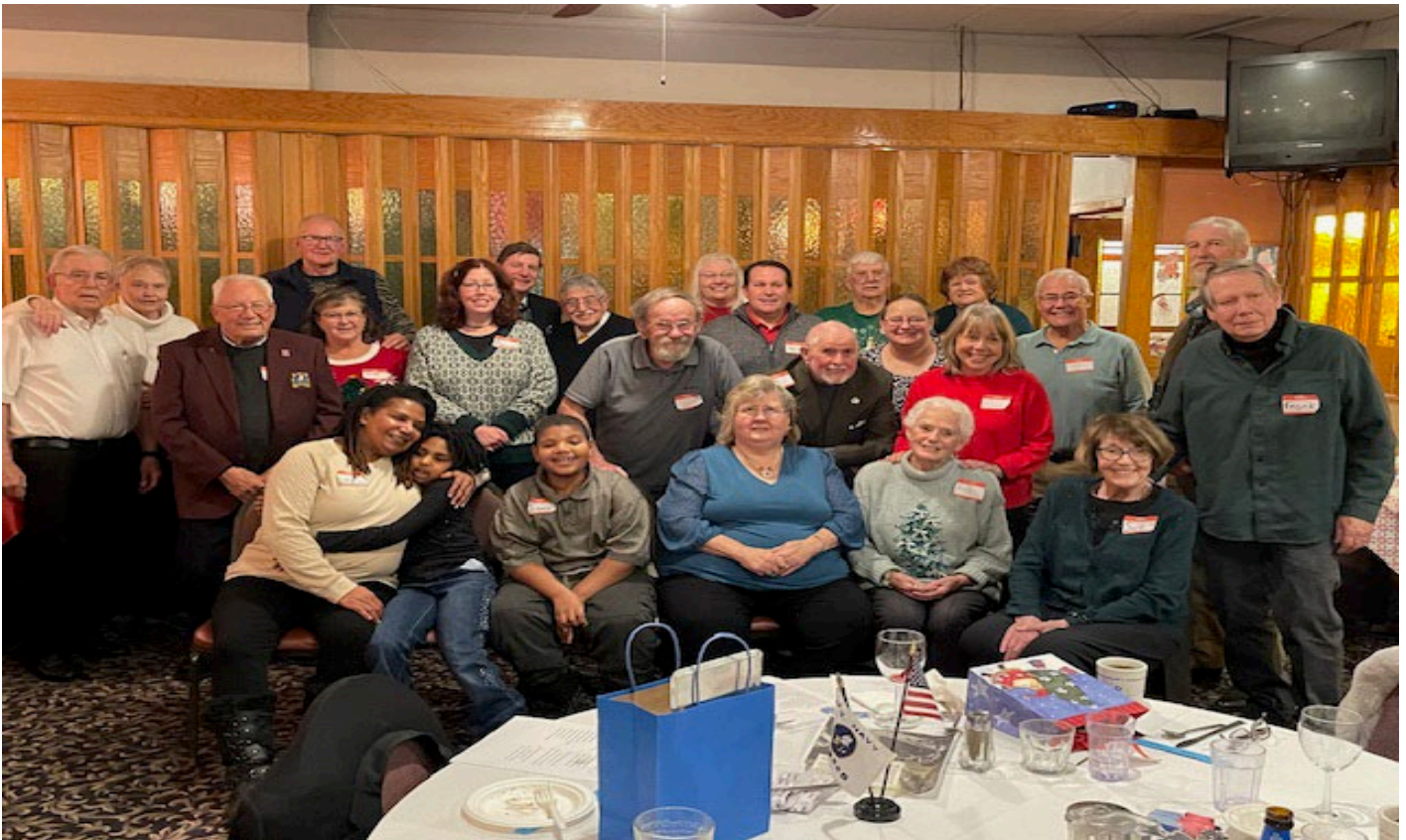
NSVA Island X-12 Rochester, NY Holiday Dinner Celebration