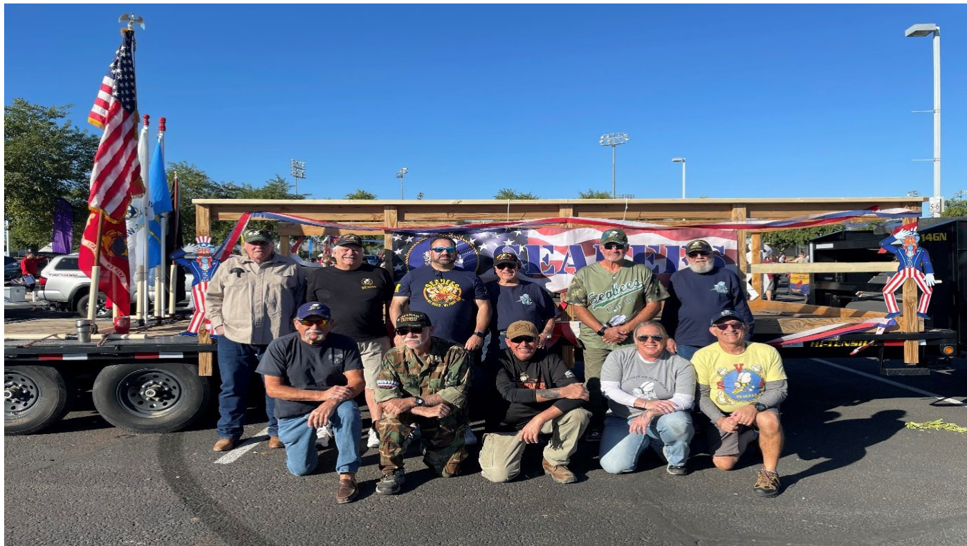
An Arizona Island X5 contingent was in the 2024 Veterans Day Parade. We had a nice turn out for the event.

NOW HEAR THIS***NOW HEAR THIS***NOW HEAR THIS